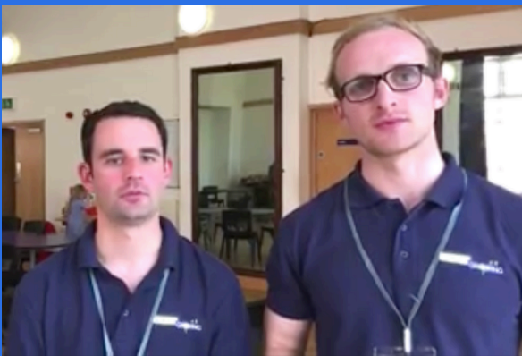
After School Club 2016