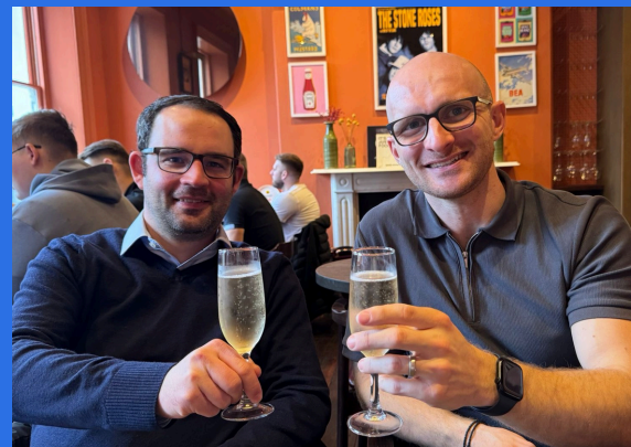
10 year celebration 2025