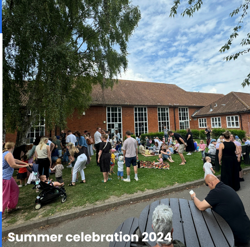
Summer celebration 2024